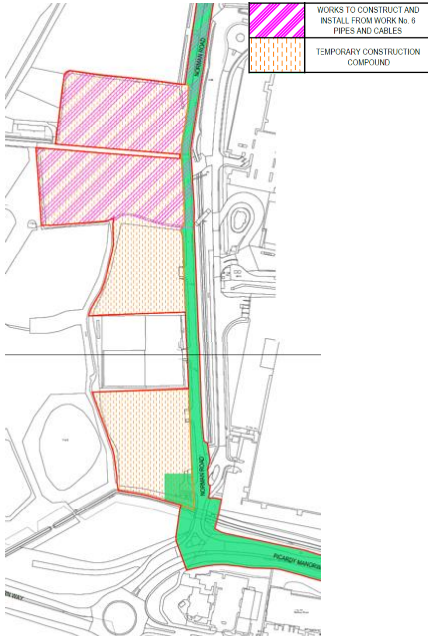
Figure 5-1: Main Temporary Construction Compound Location